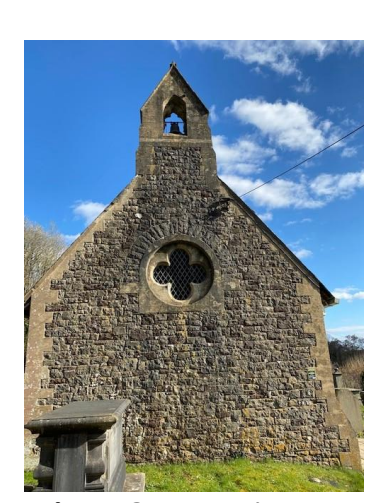
Figure 3: West View

There is a pointed arch lightly moulded south doorway up three steps to a boarded door with decorative hinges. The church has trefoil-headed nave windows and similar smaller windows to the south chancel with a quatrefoil west window.