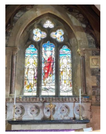
Figure 7: The East Window

The stained glass window in St Ellteyrn's ( Figure 7 ) is dedicated to the memory of William James a former parishioner, and his family. On the north wall is a marble memorial plaque dedicated to Morgan Williams dated 1763. There is also a painted hatchment ( Figure 8 ) in a diamond shaped frame on the north wall.