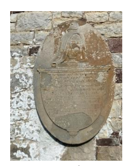
Figure 4: Plaque

The east window has three lights with trefoil tracery flanked by carved shields in rectangular frames. There are buttresses at the south west, south east and north east of the nave.