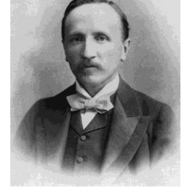
Figure 1: Robert Clive-Windsor

The existing Church was built in 1862 and was originally a Chapel of Ease for St. Fagans, and hence the Earl of Plymouth, Robert Clive-Windsor ( Figure 1 ) who owned St. Fagans Castle at the time. It was an Anglican chapel situated for the convenience of parishioners living a long way from the Parish church. It is one of the smallest places of worship within the Diocese of Llandaff.