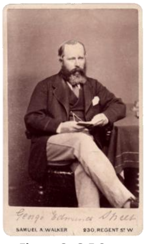
Figure 2: G E Street

In the late 1990s, the church at Capel Llanilltern became the responsibility of the Vicar of Pentyrch.