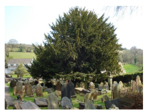
Figure 7: The Yew Tree

the tree will be between 500 and 1,000 years old. The Churchyard is maintained by a local gardener and the Parishioners also play an active role in ensuring flowerpots have seasonal plantings.