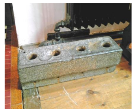
Figure 5: Wedding Cannon

10 inches deep, with a sloping roof. It had to be redesigned and enlarged so that an extended chamber could be developed for a new pipe organ. The new vestry and housing are 13ft 6 inches long by 16ft 3 inches deep. A sketched (current) layout of the church is provided in Figure 6 overleaf.