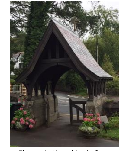
Figure 1: Listed Lych Gate

It has a tall nave with slender south-west turret, shallow south porch, slightly lower, narrower chancel, wide extended north vestry turret is octagonal and is decorated with canopy work, blind and in the form of gabled buttresses to the lower stage which also has a deep battered plinth, open above, with a tall slender spirelet incorporating small pierced cinquefoil and lancet openings. The south porch also with steep-pitched roof, has a high pointed-arched moulded doorway with decorative voussoirs and buttresses with offsets and reset monuments either side. The nave and chancel have mostly 2-light pointed arched windows with curvilinear tracery; prominent diagonal buttresses with stepped coping at corners. Fine large east and west windows with elegant curvilinear tracery. Churchyard contains several early- mid 19th century chest tombs especially to SE.