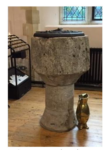
Figure 3: Medieval Font